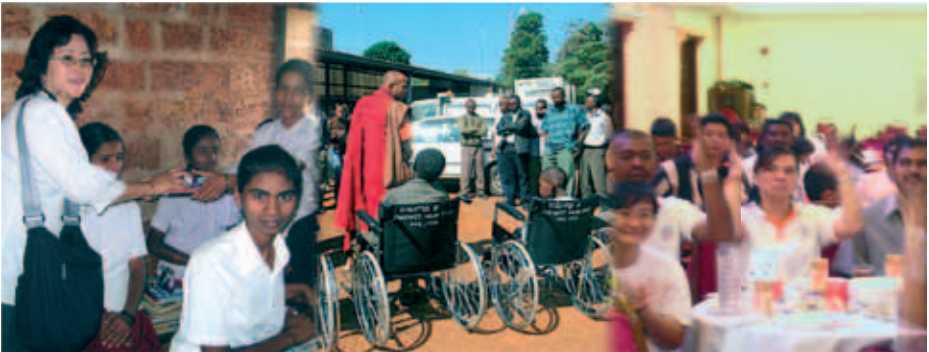
Helping the Untouchables